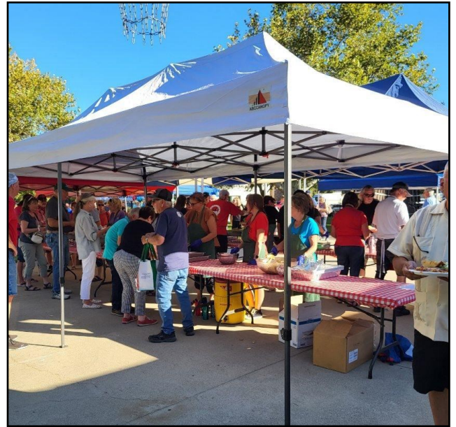
Just one view of the crowds lined up for dinner at Paesano Days on Friday night.

We are all looking forward to another great event in 2025.