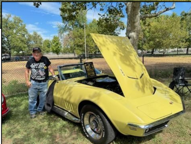
Above view of just a few of many cars for show at Paesano Days. Below one of the winners at the show.