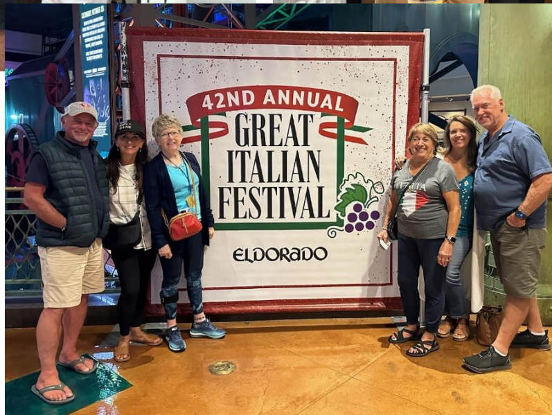
Left: Friends and family attend the Great Italian Festival in Reno on Columbus day 2024.